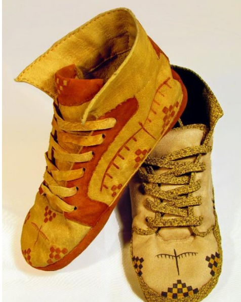
Levi George syilx artist -Traditional Expressions Class 2011 (natural material)